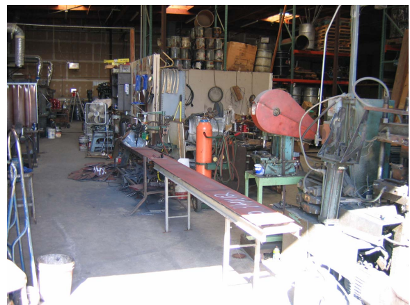
Welding, cutting, machining